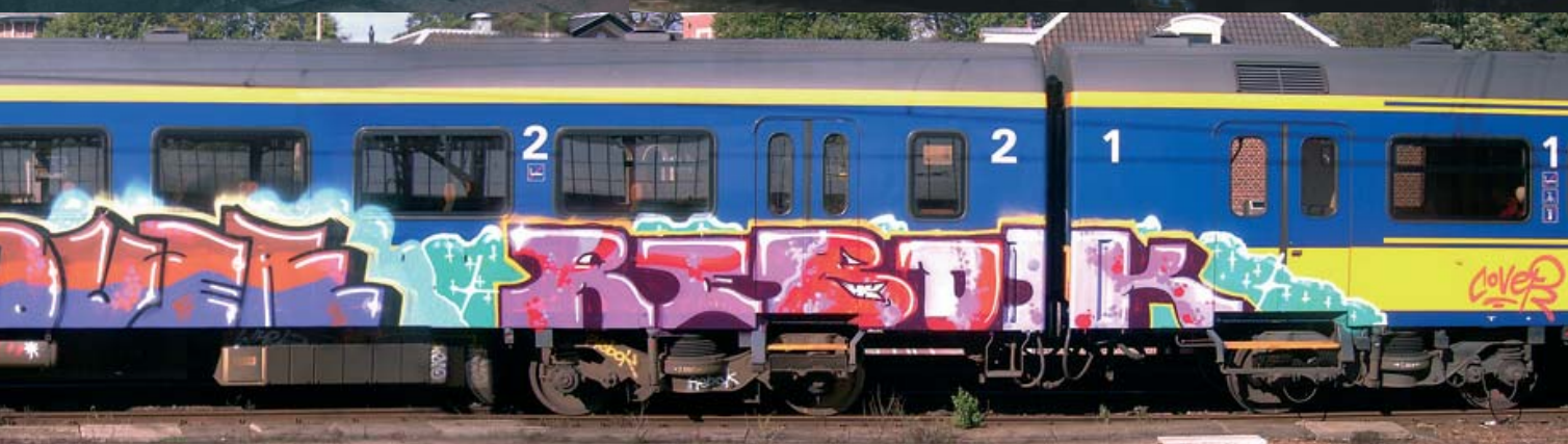
005 7 TRUE 2005 8 CASETE 2005 9 NITWIT BASEL 2005 10 OFIA COPENHAGEN 2005 11 FPOE 2005 8 WHEL, COVER AND REBOK 2005