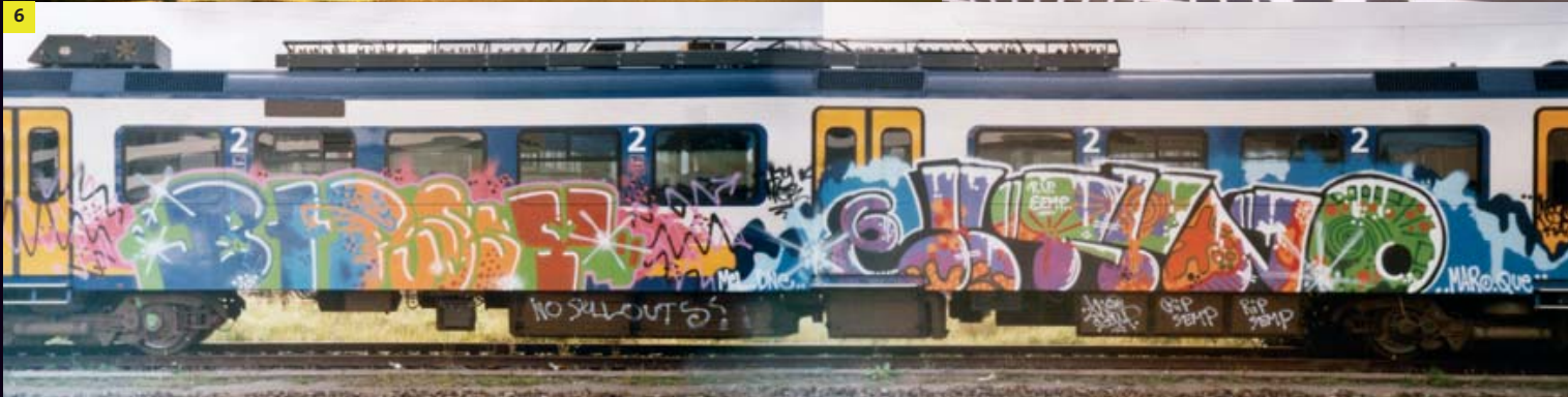
1 CORA AND HOZE NAP 2005 2 TAPS BRD 2005 3 XTRA IT 2005 4 KOSMO AND IOS ADAM 2005 5 LFS BRD 2005 6 BTPUSSY AND XFYNO NL 2005