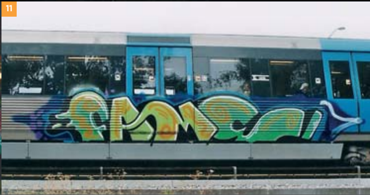
1 WHOLECAR BY DSF PART OF A WHOLETRAIN HAMBURG 2005 2 AHITO ROME 2005 3 CORA NAPELS 2005 4 RDR OSLO 2005 5 HEGS NAPELS 2005 6 AFS NAPELS 2005 7 RITMO HAMBURG 2005 8 MASK BRUSSEL 2005 9 TISKO PARIS 2005 10 WATS GREECE 2004 11 FAME STOCKHOLM 2005 12 GANG PARIS 2005 13 STR BARCELONA 2005 14 F.UP OSLO 2005 15 HIROCK LISBOA 2005 16 BANOS BARCELONA 2005 17 FARM MILAN 2005