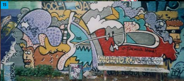
AND KESY SWS 2005