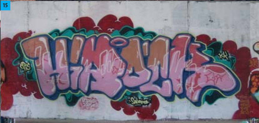
9 RUMBL AND GEK 2005