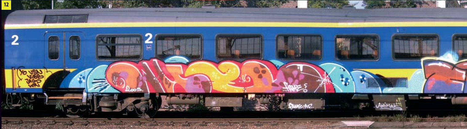
1 HAPPY B-DAY SHE BELGIUM 2005 2 LEPETJE 2005 3 TALIB 2005 4 TRI'O', RIAG AND ISH 2005 5 Ros, ozon AND KAR DENMARK 2005 6 NASE BELGIUM 2005